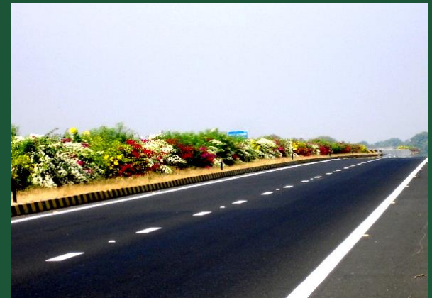
Roads & highways