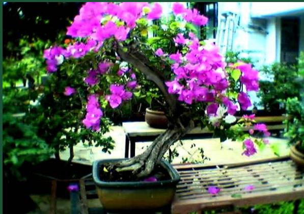
Pots & bonsais