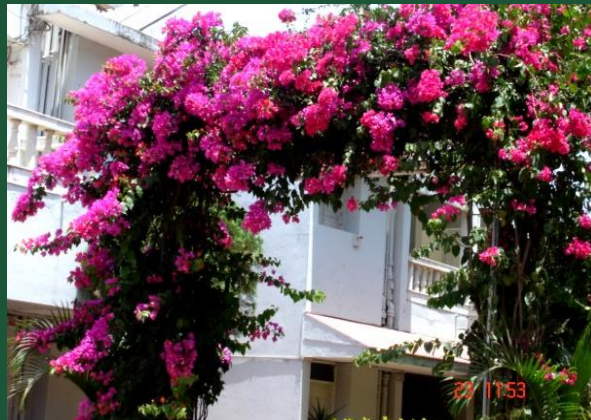
Shrubs & pergolas